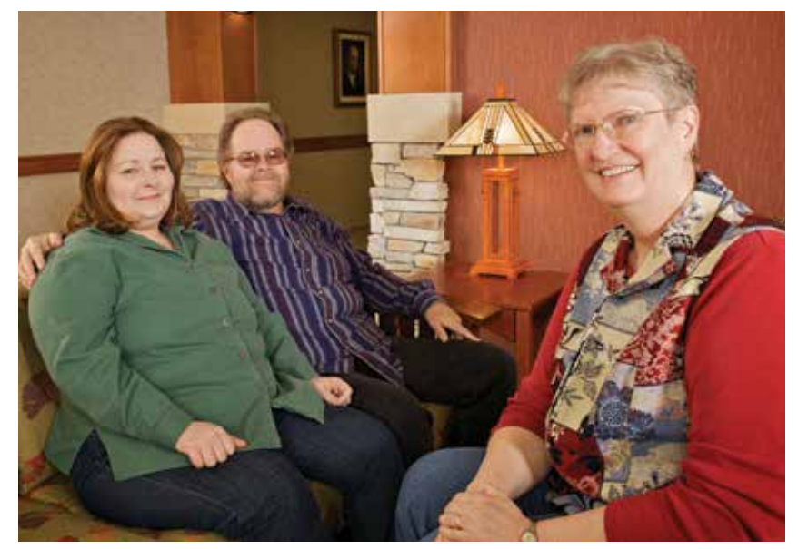
* Only employees who live in Kalkaska county